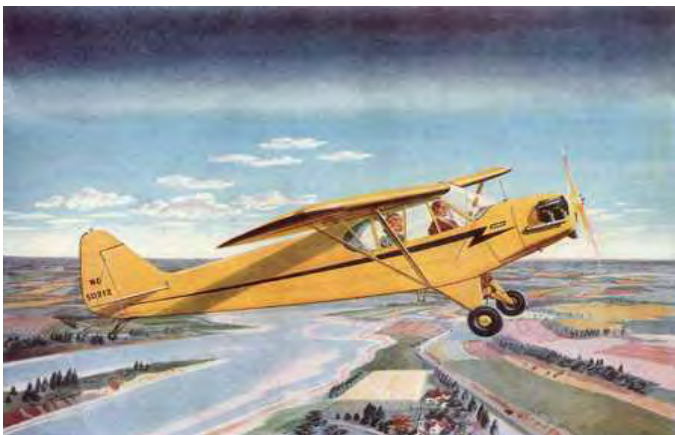
J3 Cub in full flight, not at the flyin