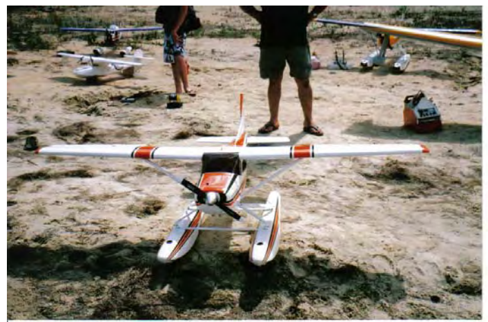
Ian's Cessna 185 and part of the wing of the Catalina which is over 5 metres can be seen in the background (it was bit shorter than that after the last flight)