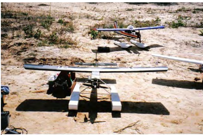
The two Boomerang 60 planes on floats, Woodie's modified version in the foreground and Ian's in the background

It would appear that all had a good weekend even though it is over three hours drive to get to the venue, float flying poses a few more problems than land planes but that's what makes it fun, Woody was quoted as saying.